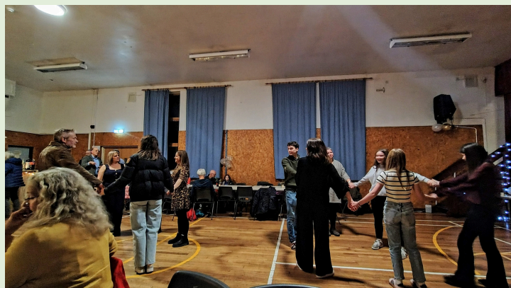
A photo from our 20 th Anniversary Ceilidh and AGM

Please return your completed application to the address below. Full members are entitled to elect and be elected as Directors. All members will receive regular updates and are welcome to comment on, support and get involved in our activities.